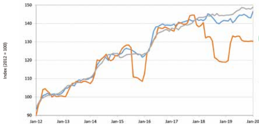
Figure 4 PPI indices of unprocessed milk and dairy products, and the CPI of milk, cheese, and eggs, Jan 2012–Jan 2020