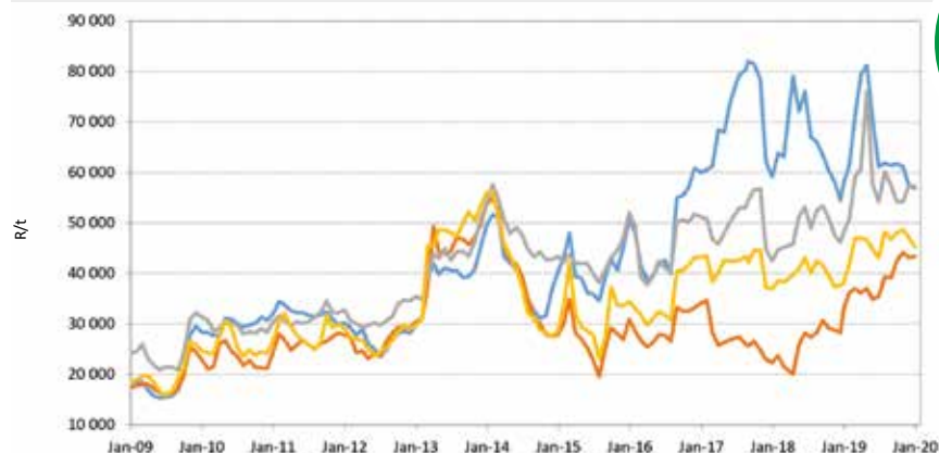
Figure 1 International dairy product prices (free on board), Jan 2009–Jan 2020