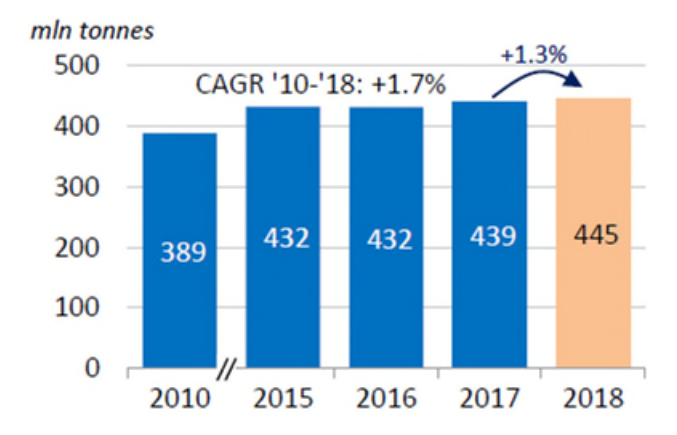
Global milk deliveries trends

The total production of liquid and concentrated dairy products logically follows the trend in milk deliveries. Growth for the different dairy products differ widely. Growth in the production of packaged milk (liquid milk) was zero from 2017 to 2018 while the production of fermented dairy products increased by 2,1%. The production of packaged milk in the EU reduced by 2,6%, historically the top