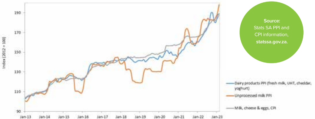
Figure 4 PPI indices of unprocessed milk and dairy products, and the CPI of milk, cheese, and eggs, Jan 2013–Feb 2023