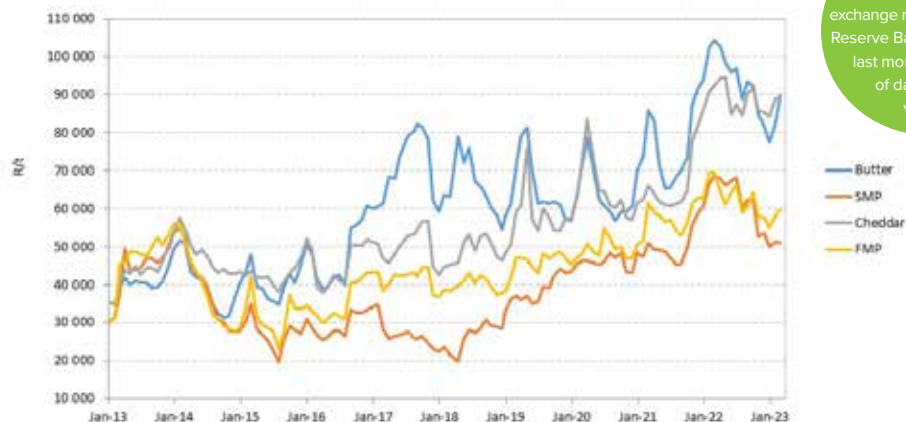
Figure 1 International dairy product prices (free on board), Jan 2013–March 2023