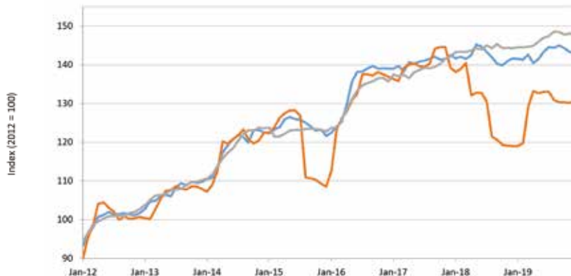
Figure 4 PPI indices of unprocessed milk and dairy products, and the CPI of milk, cheese, and eggs, Jan 2012–Dec 2019