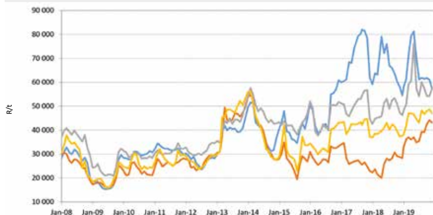
Figure 1 International dairy product prices (free on board), Jan 2008–Dec 2019