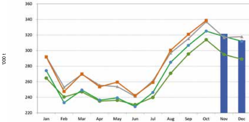
Figure 2 Monthly unprocessed milk purchase trends, Jan 2016–Dec 2019

Source: Milk SA statistics. Note: Jan 2016–Dec 2018 reviewed, based on total figures declared to Milk SA.